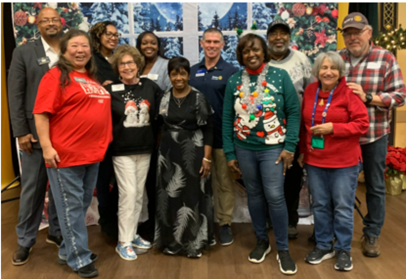
Atlanta Southern Crescent Rotary Christmas