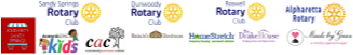
USDA FOOD BOXES PICK UP & DISTRIBUTION AT SOLIDARITY SANDY SPRINGS MAY 20, 2021