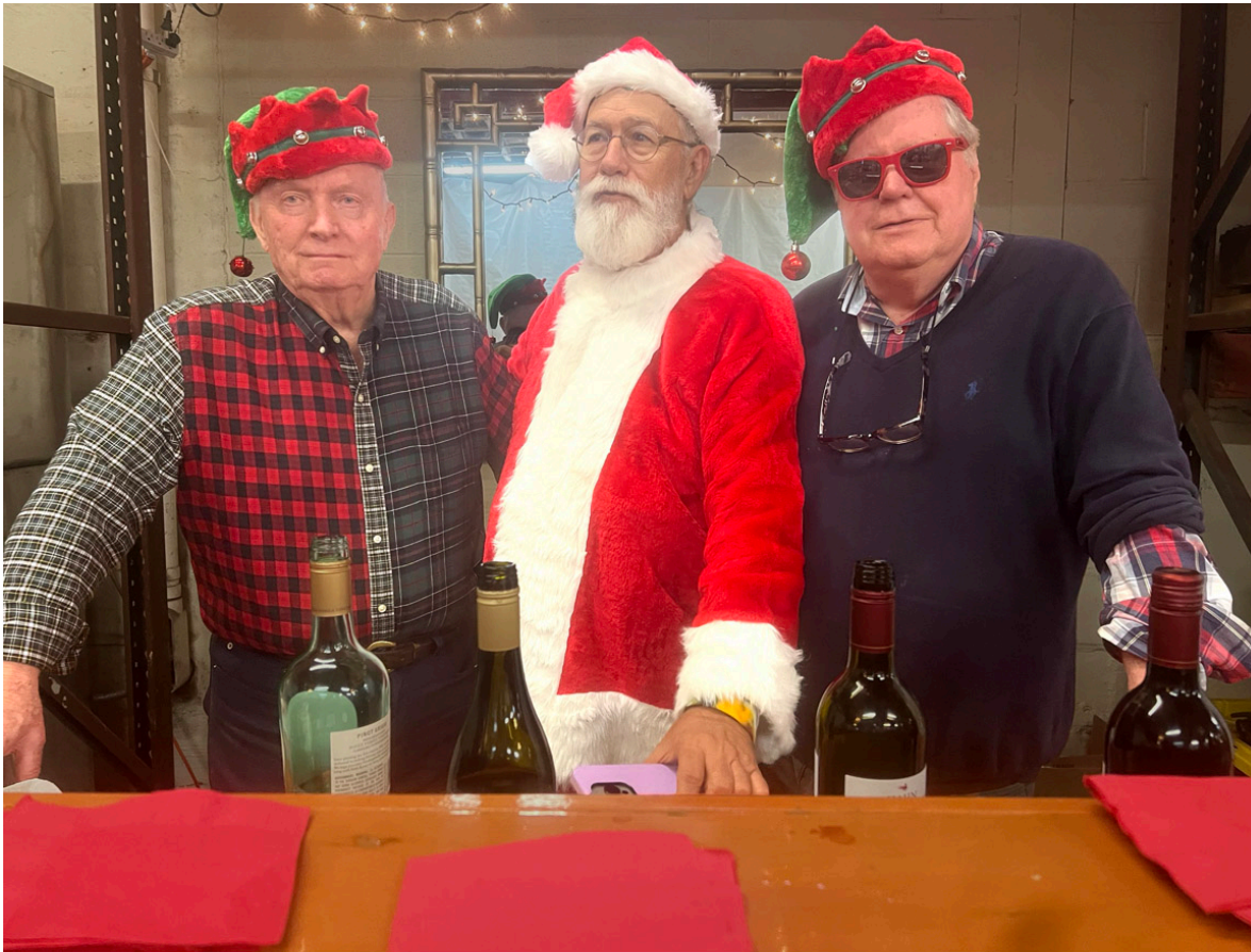
The Christmas Party Hosts