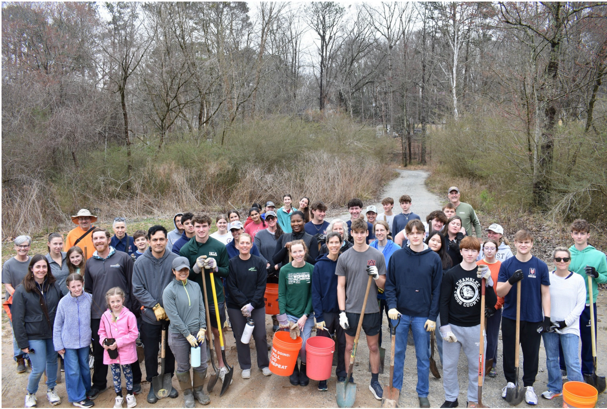
Brookhaven Rotarians joined other community groups for February's Arbor Day tree planting event cohosted by the Murphey Candler Park Conservancy and Brookhaven's Tree Canopy Preservation team