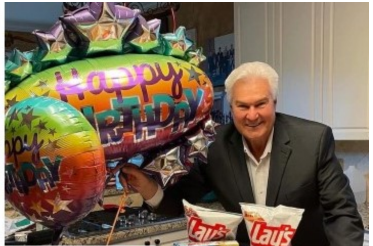
Johns Creek North Fulton