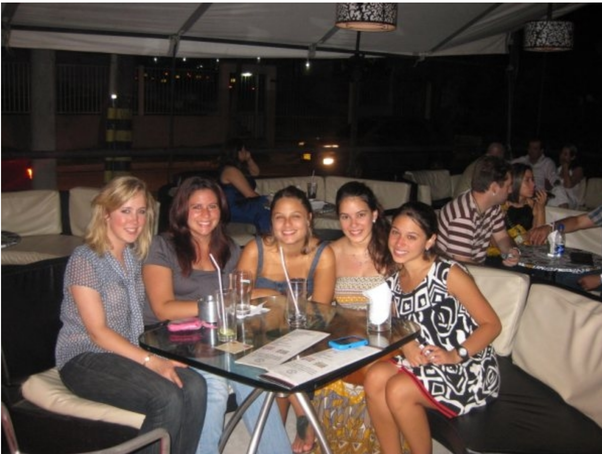
Posted by Ian Bond July 6, 2021