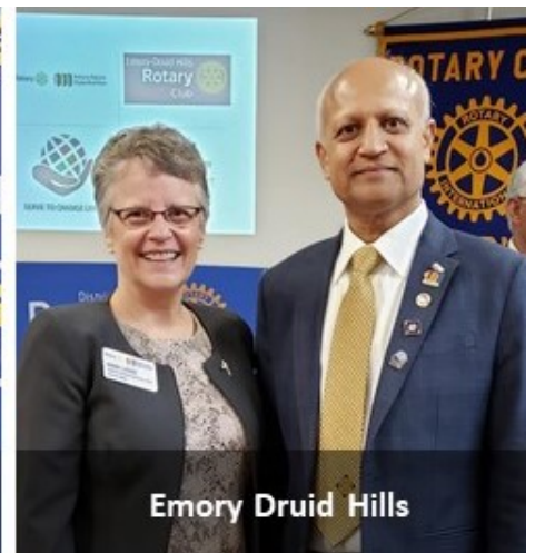
Emory Druid Hills