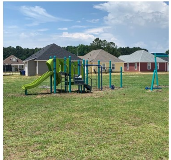
Posted by Jackie Cuthbert July 6, 2021