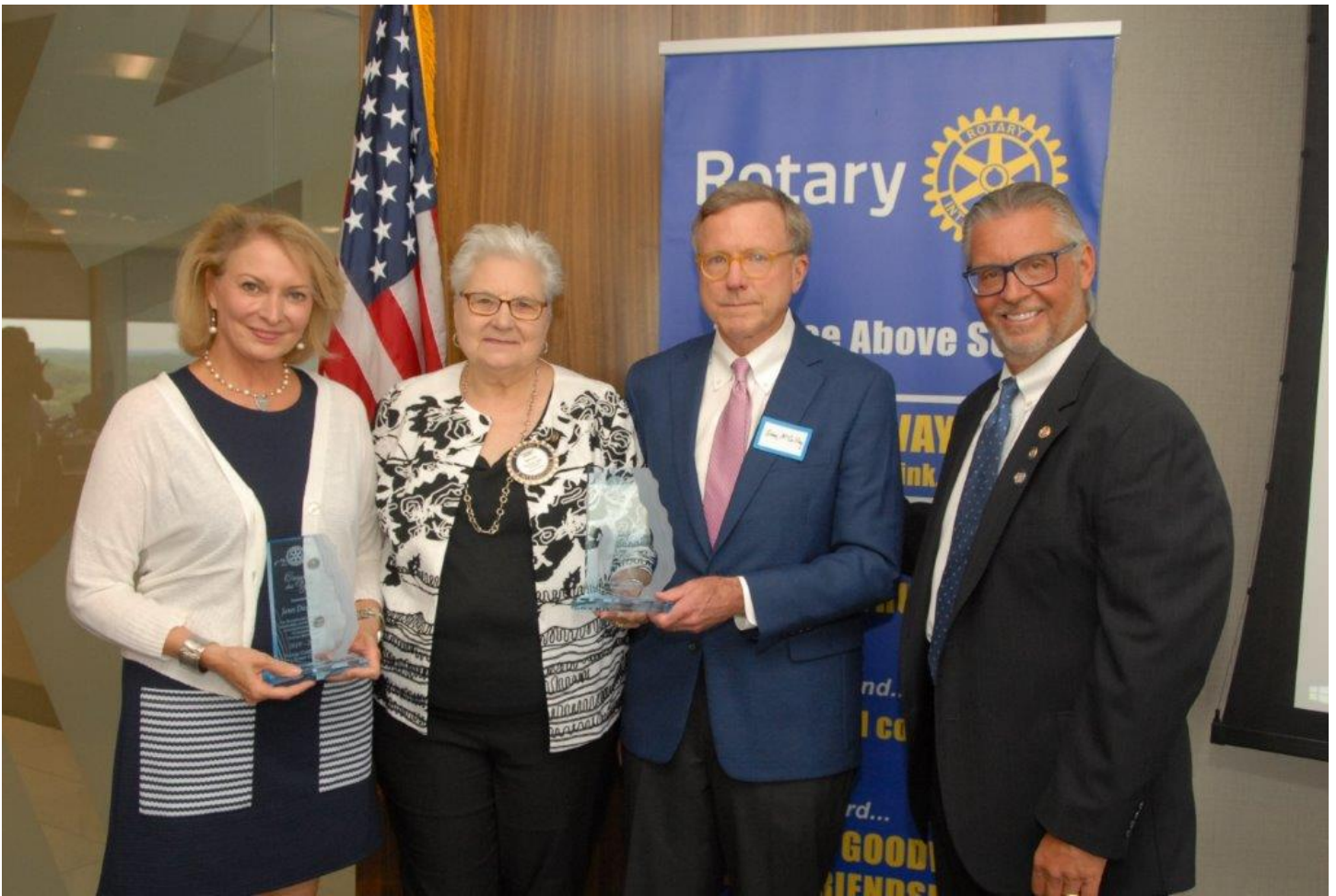
Posted by Brenda Borden July 2, 2021