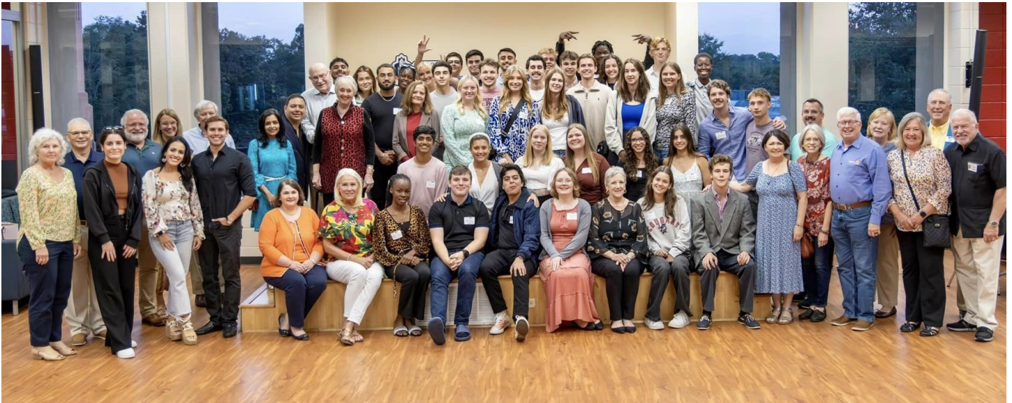
Posted by Katheryne Fields October 2, 2023