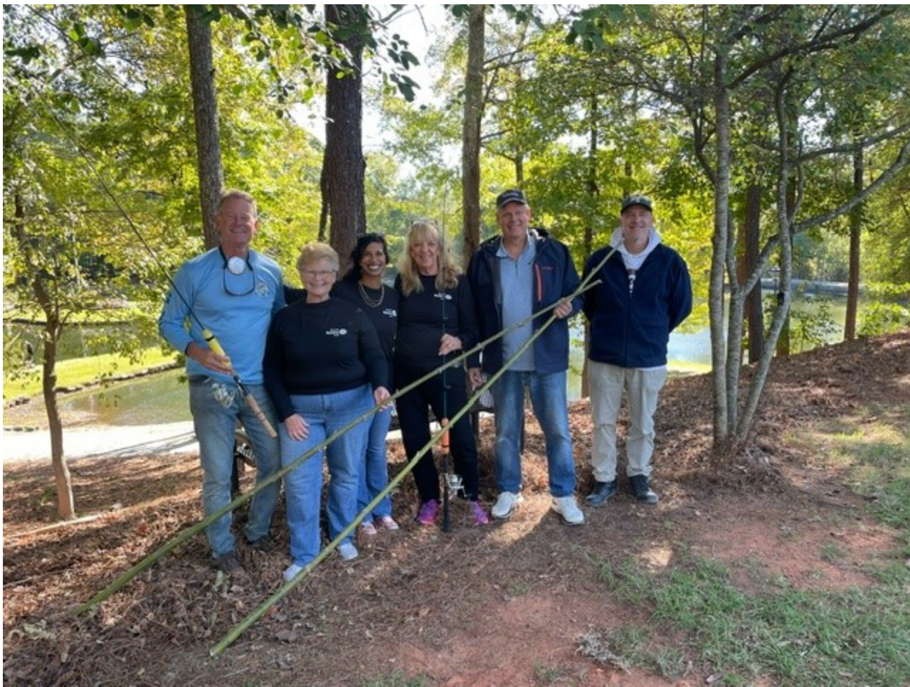
Posted by Kathryn Igou December 3, 2024