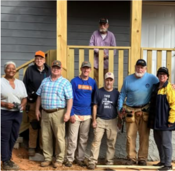
Posted by Janice Wallace January 3, 2025