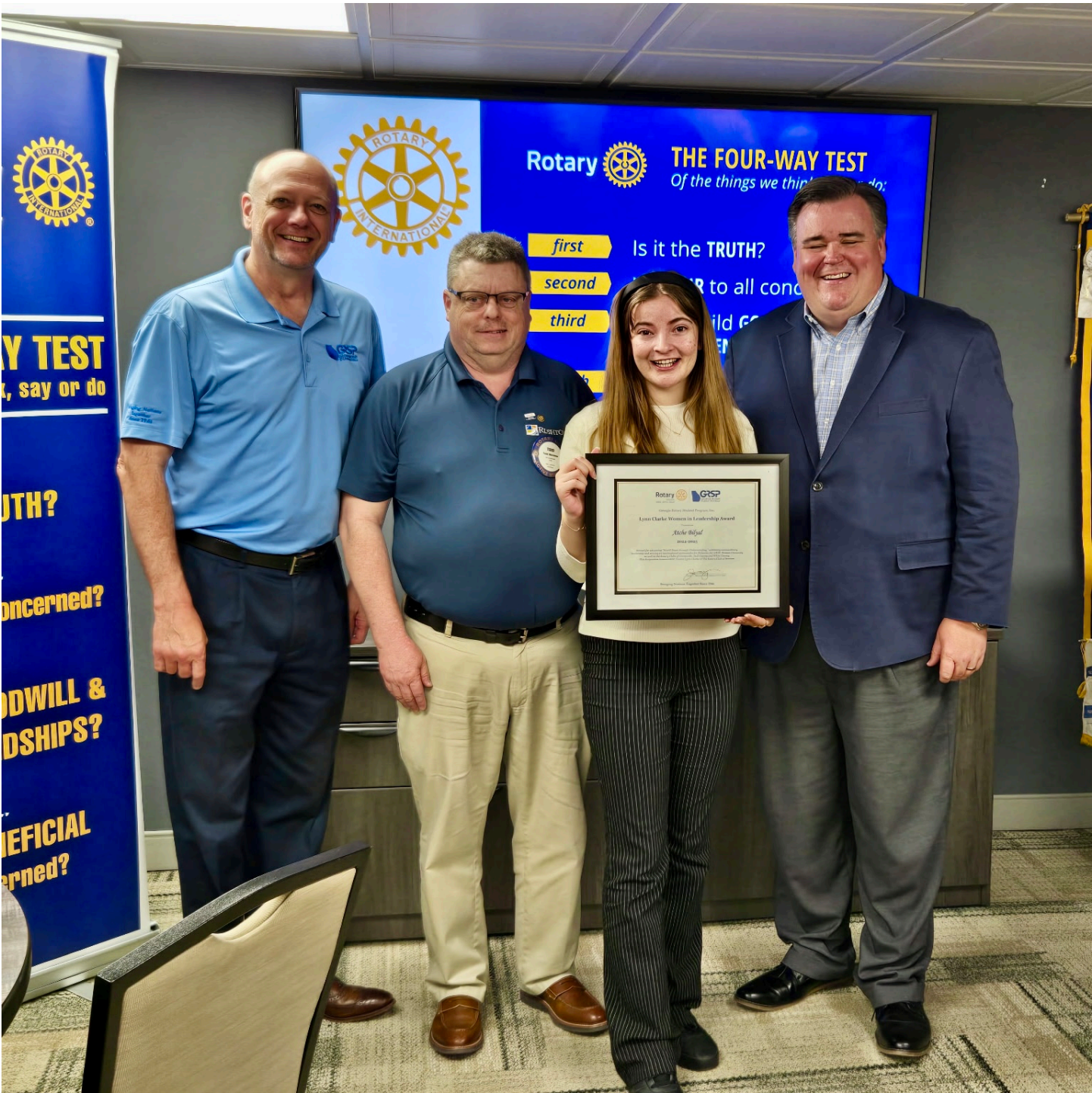
Posted by Kathy Fields May 3, 2025