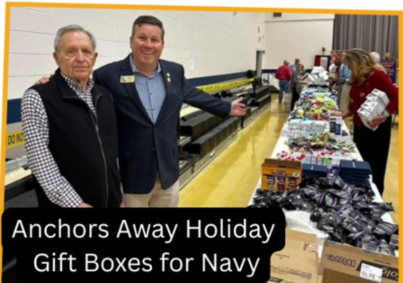
Anchors Away Holiday Gift Boxes for Navy