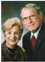
By Governor Stroup and Sandy Stroup